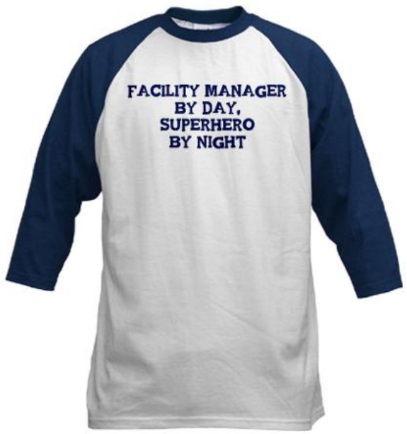
About Baseball Jersey $24.00

Are you looking for some unique gift ideas for the Facilities Manager?