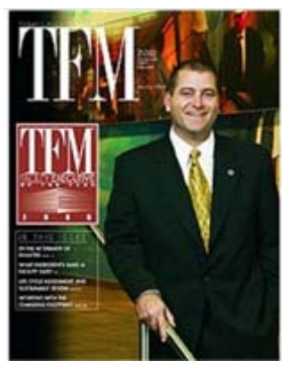
TFM – Today's Facilities Manager Subscription – 8 issues $65.00

http://shop.cafepress.com/facilities-manager