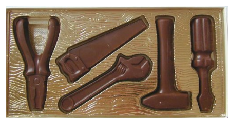
Milk Chocolate Tool Set Gift $20.95