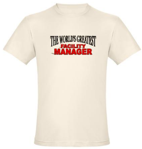
The World's Greatest Facility Manager T-Shirt $24.50

http://shop.cafepress.com/facilities-manager