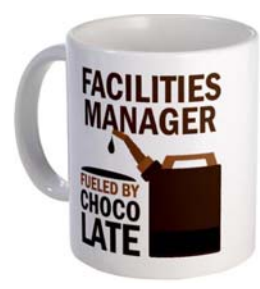
Facilities Manager Gift Mug $15

http://shop.cafepress.com/facilities-manager