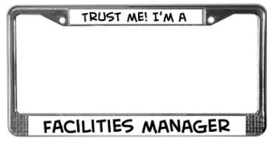
Trust me I am a Facilities Manager License Plate Frame $15

http://shop.cafepress.com/facilities-manager